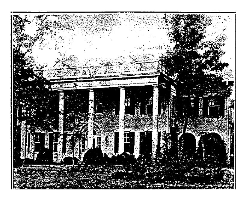
Harold O. Rogers, Residence

Examples of this period of work are shown below.